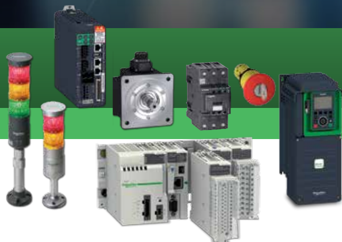
Tabela de Preços | Março 2019